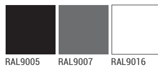
RAL9005 RAL9007 RAL9016